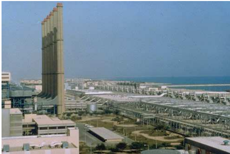
Figure 1: Shoaiba desalination facility.

Water desalination is the process of producing drinkable water from brine. The primary input to a desalination plant is usually seawater, although brackish groundwater may also be used. Approximately 60% of the world's desalination plants are found in the Middle East. The Shoaiba desalination plant in Saudi Arabia is the largest desalination plant in the world produces and produces over 150 million \text{m}^3 of fresh water per year. The cost to build this plant was approximately $1.06 billion. Only a limited number of desalination facilities operate in the United States due to the high cost of desalination compared to groundwater pumping from water-rich areas to those in need.